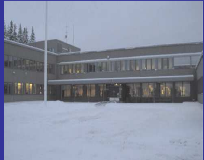
TRYSIL VIDEREGAAENDE SKOLE

The students and teachers of the host country gave the project partners a warm welcome despite the cold weather outside, having told us that it had been the first sunny day there for months and that no sooner had we arrived than the sunrays made their entrance. Trysil is the largest ski resort in Norway, skiing representing for the inhabitants, a way of life, a source of income and a hobby. The Norwegian teachers and students organised a tour of the town where they presented its key aspects: the nice people, the church, the library and moments of history. The mayor of Trysil described the area from the historical and economic point of view, referring also to the plans for the future that they had for its economic development.