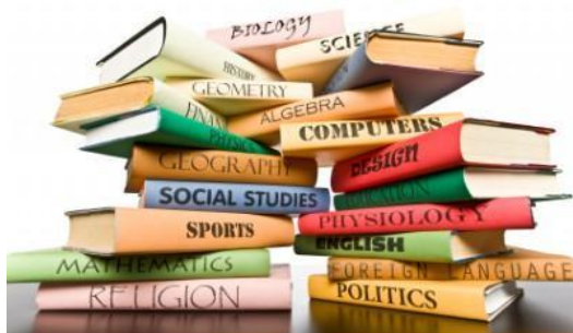
A teen has to go through different subjects. He/she gets homework in most of the subjects

As a conclusion that importance of that education is very precious, to build the future we want. So why don't we try to take a step away from all those technological gadgets and let our teachers educate us for a while! It is for a good!!!